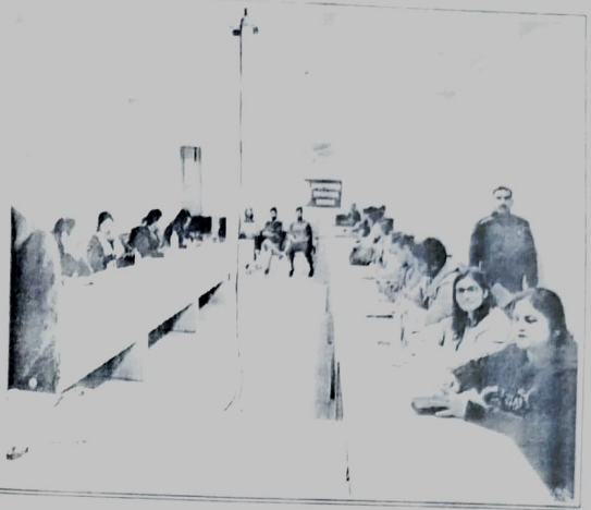
SENSITIZATION and COORDINATION MEETING RWS Organize this meeting with UPSACS in Lucknow.