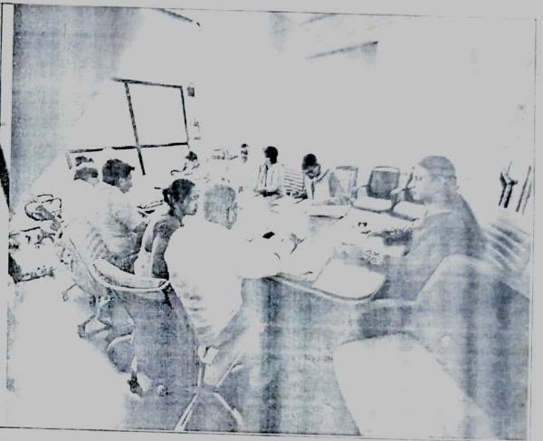
SENSITIZATION and COORDINATION MEETING

RWS Organised this meeting with the District Social Welfare Department