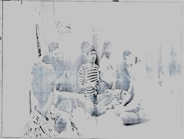
Saksham (Parlour group)